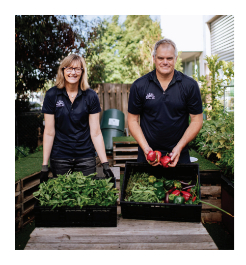
See website for stockist locations